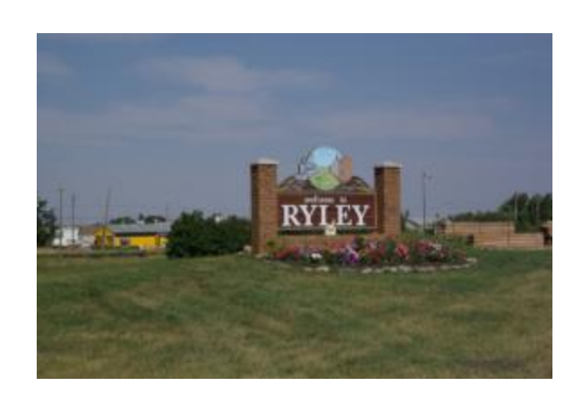
BEAVER COUNTY Bylaw 08-943 (amended by Bylaw 12-998)

VILLAGE OF RYLEY Bylaw 2008-882 (amended in 2012)