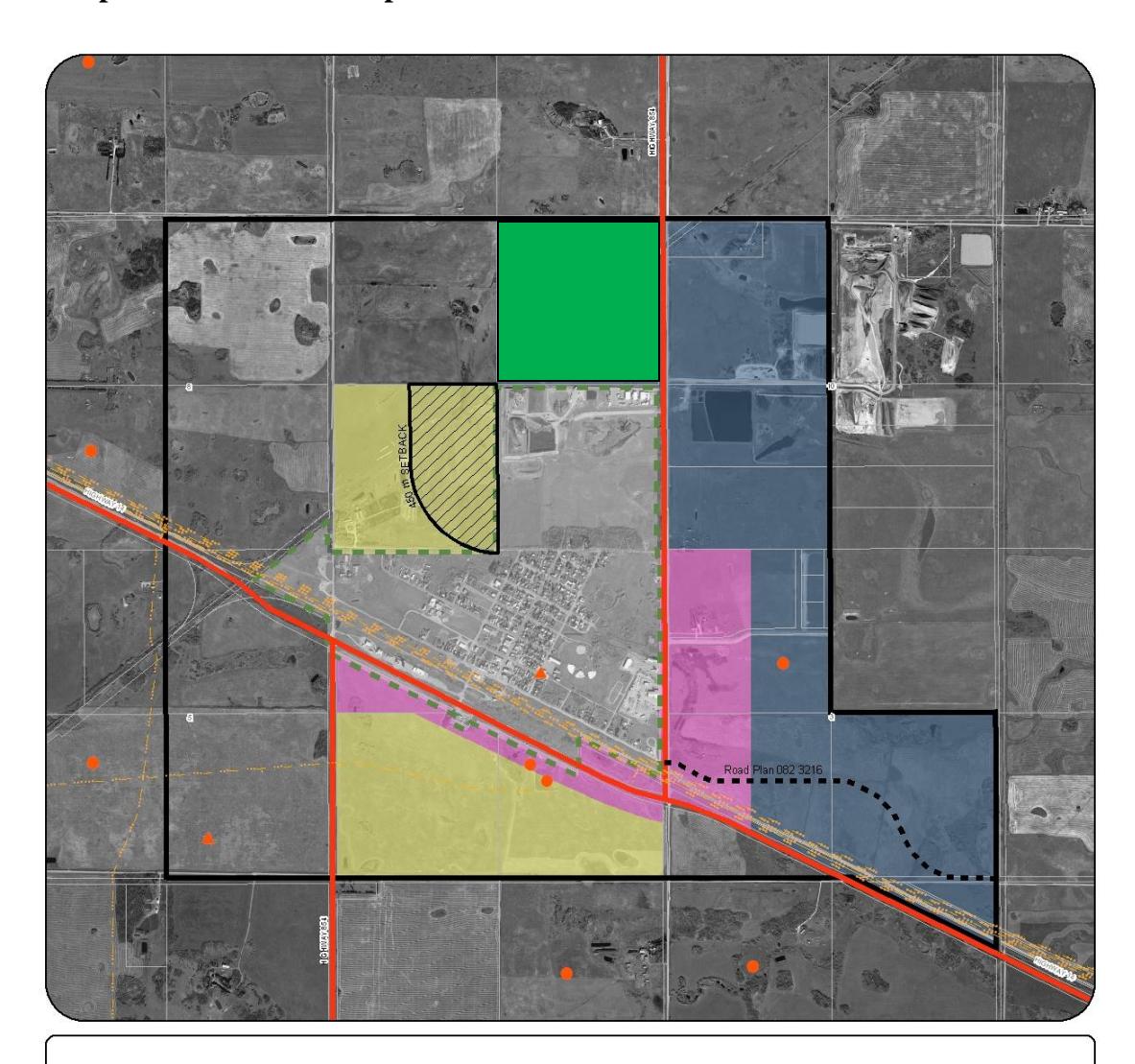
Map 2 – Land Use Concept