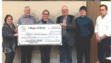
Left: Ryley Youth Group