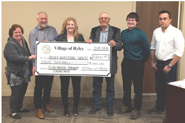
Above: Holden Ag. Society