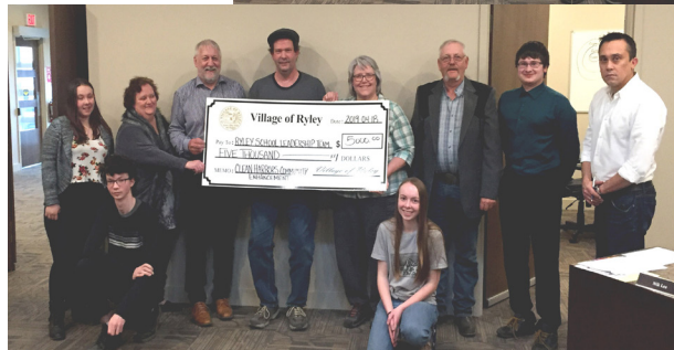
Above: Ryley School Leadership Team