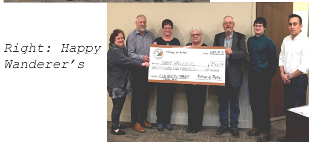
Right: Happy Wanderer's