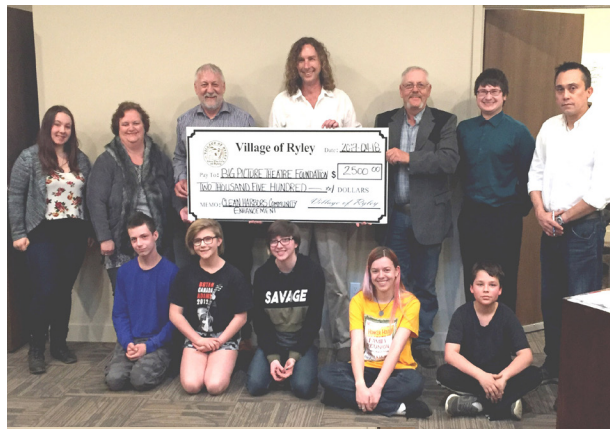
Above: Big Picture Theatre Foundation