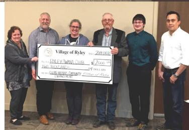
Right: Ryley AWANA Program