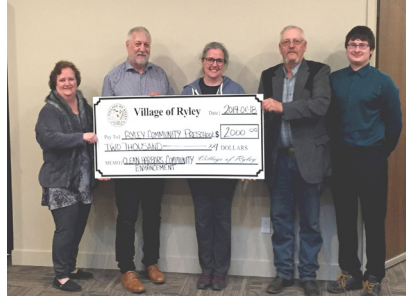
Left: Ryley Preschool