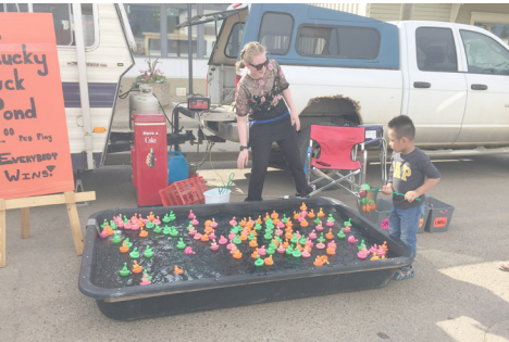
Rubber ducky might be lucky! This young fella tried his hand at winning a few prizes fishing for rubber ducks at Ryley Music Festival.