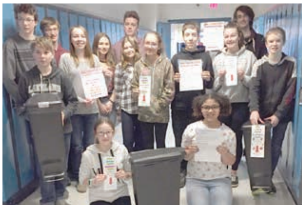
Ryley School Leadership Team

Zinc is essential for humans. Zinc deficiency affects about 1.2 billion people worldwide, and 200,000 children under the age of five die each year from not having access to zinc in their diets. This is why we would like to help. This program is brought to you by Teck and UNICEF. The amount of zinc in one AA battery, is enough to save the lives of six children. There is an added benefit of keeping batteries out of landfills which protects our environment.