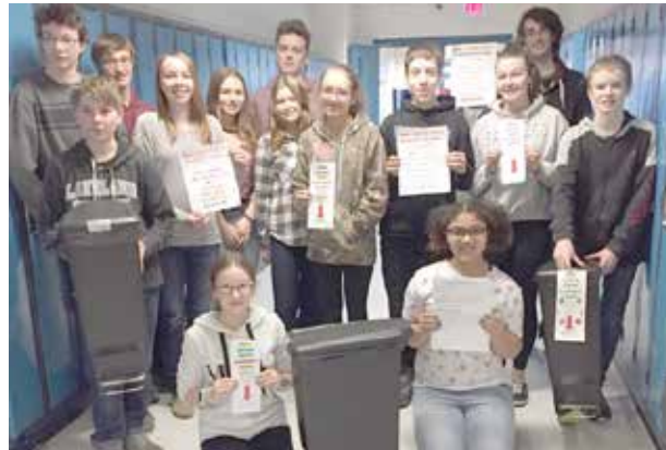
Ryley School Leadership Team

Zinc is essential for humans. Zinc deficiency affects about 1.2 billion people worldwide, and 200,000 children under the age of five die each year from not having access to zinc in their diets. This is why we would like to help. This program is brought to you by Teck and UNICEF. The amount of zinc in one AA battery, is enough to save the lives of six children. There is an added benefit of keeping batteries out of landfills which protects our environment.