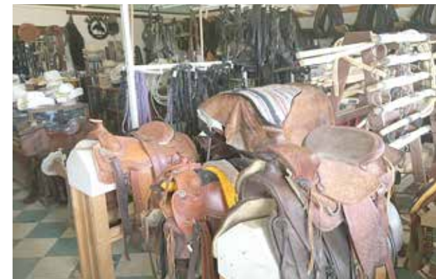
There's no denying the comforting smell of leather. George's Harness & Saddlery is a living museum of authentic leather riding products in the heart of downtown Ryley.